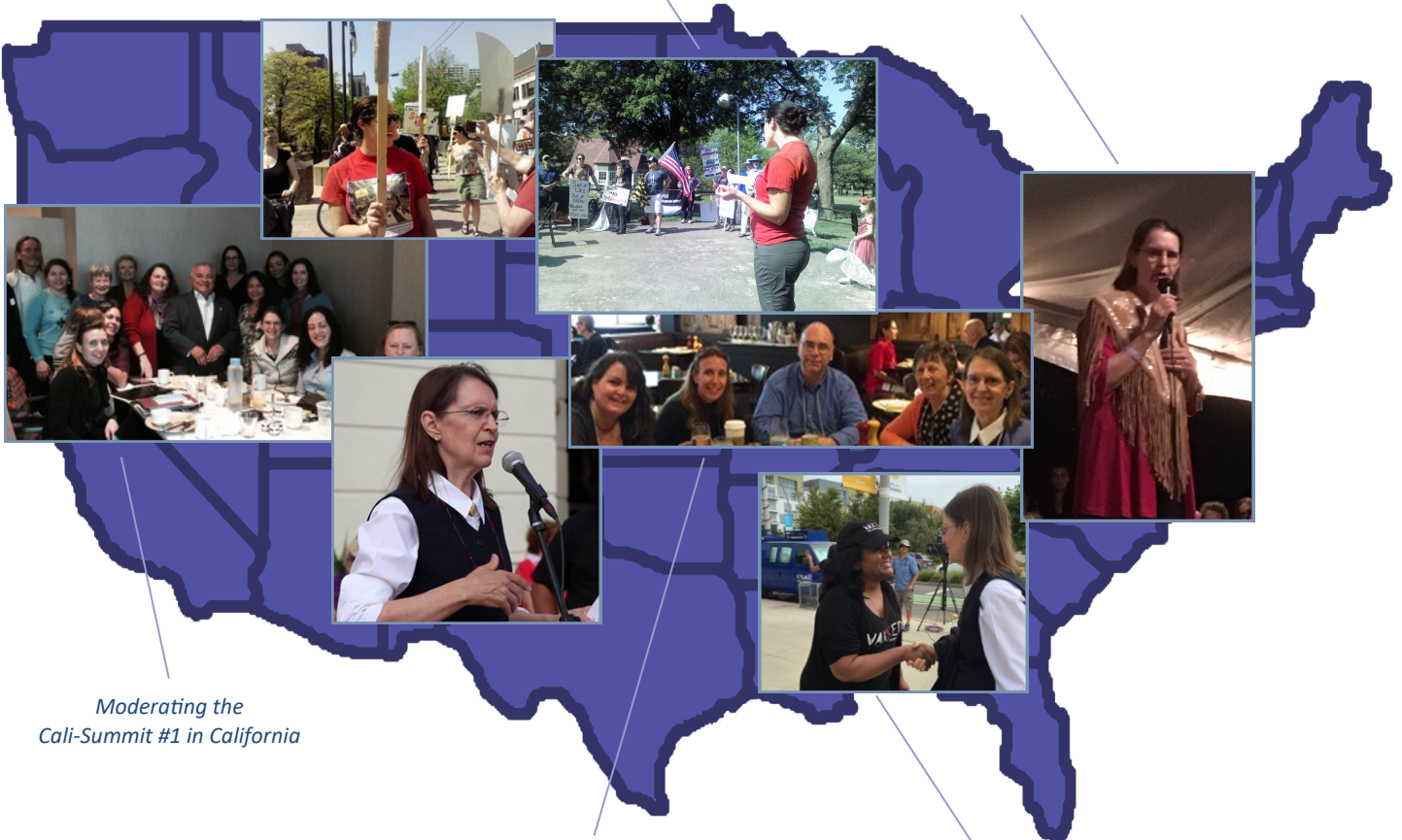
Moderating the Cali-Summit #1 in California