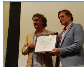
Del Bigtree and Andrew Wakefield