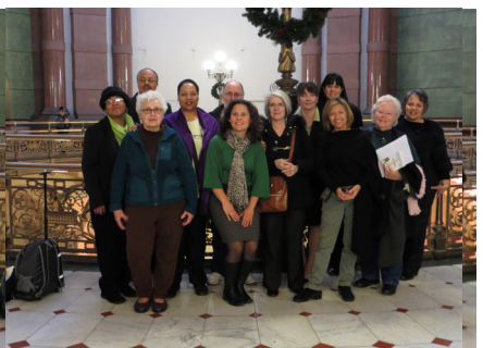
Illinois Health Freedom Leaders

asking for NHFC's participation in group start-up conference calls, and for more information on bills that might have been introduced in a state. Some of these state groups were: Colorado Sunshine Health Freedom Foundation, Colorado Springs